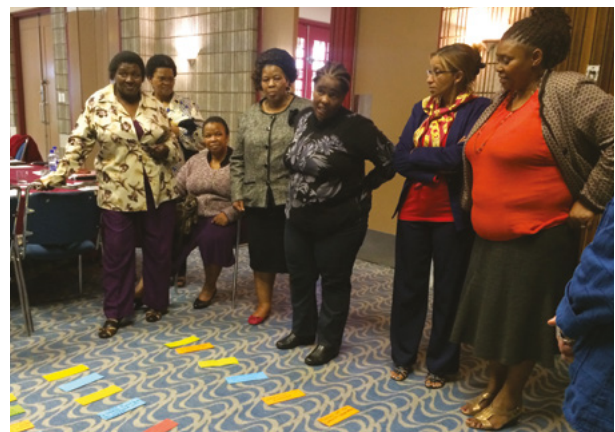
Facility managers reviewing processes for HCC establishment Port Elizabeth.

To support the roles a generic training manual has been designed and made available to all health committee members, with an understanding that facility managers also attend the training and that training be provided to staff, even if separately.