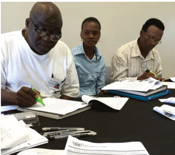
HCC members at Nomangesi Jayiya studying the policy

committees had been operating since 1996 but in a haphazard and variable manner, without guidelines for their functioning and erratic staff and management support. This frustrated members.