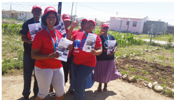
Empowered HCC in Ikamvelihle PHC facility

Communities in the Eastern Cape have played a role in formulating and implementing the guidance on their roles and functioning. In the Nelson Mandela Bay Health District, for example, health