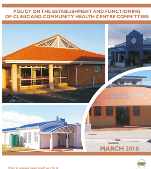
Cover, Eastern Cape policy document on HCCs 2010